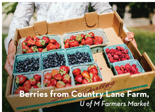
Berries from Country Lane Farm, U of M Farmers Market

OptumHealth Treatment Decision Support Service (TDS) provides one-on-one consultation that can ease the stress of sorting through information when faced with a new diagnosis for a medical condition, including back pain, knee and hip replacement, benign prostate disease, prostate cancer, breast cancer, certain uterine conditions, and angina. TDS helps give you the answers and resources you need to choose appropriate treatment. Connect with a TDS nurse by calling the 24/7 NurseLine at 1-888-887-2593.